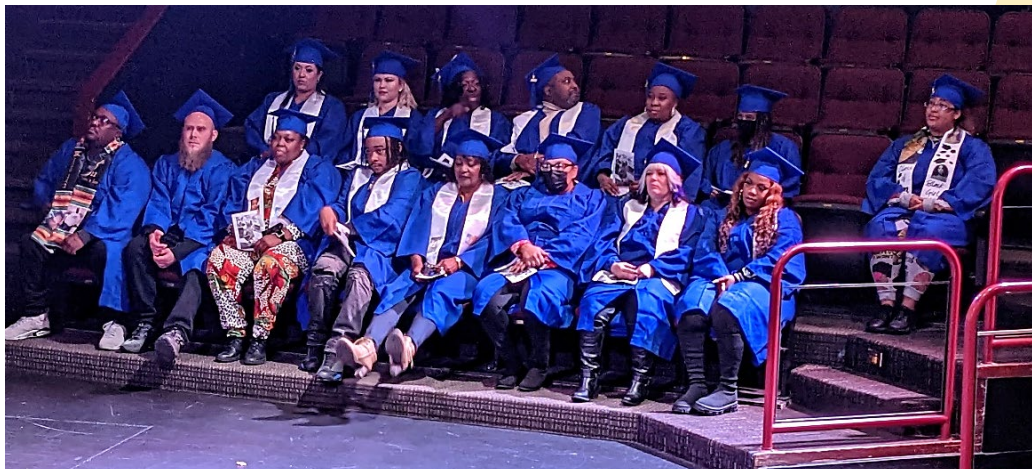
Recent COHS graduates from Rockford Public Library