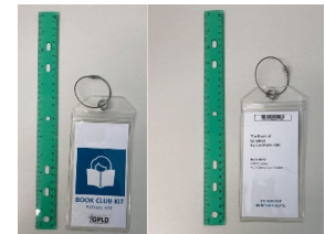
Book Club Kit prepared for RAILS Delivery with locked bag and luggage tag

SWAN is pilot testing the KitKeeper software by Plymouth Rocket to allow Book Club kits to circulate on a scheduled basis within the consortium. Book Club kits could be shared throughout the consortium as complete kits via a reservation system.