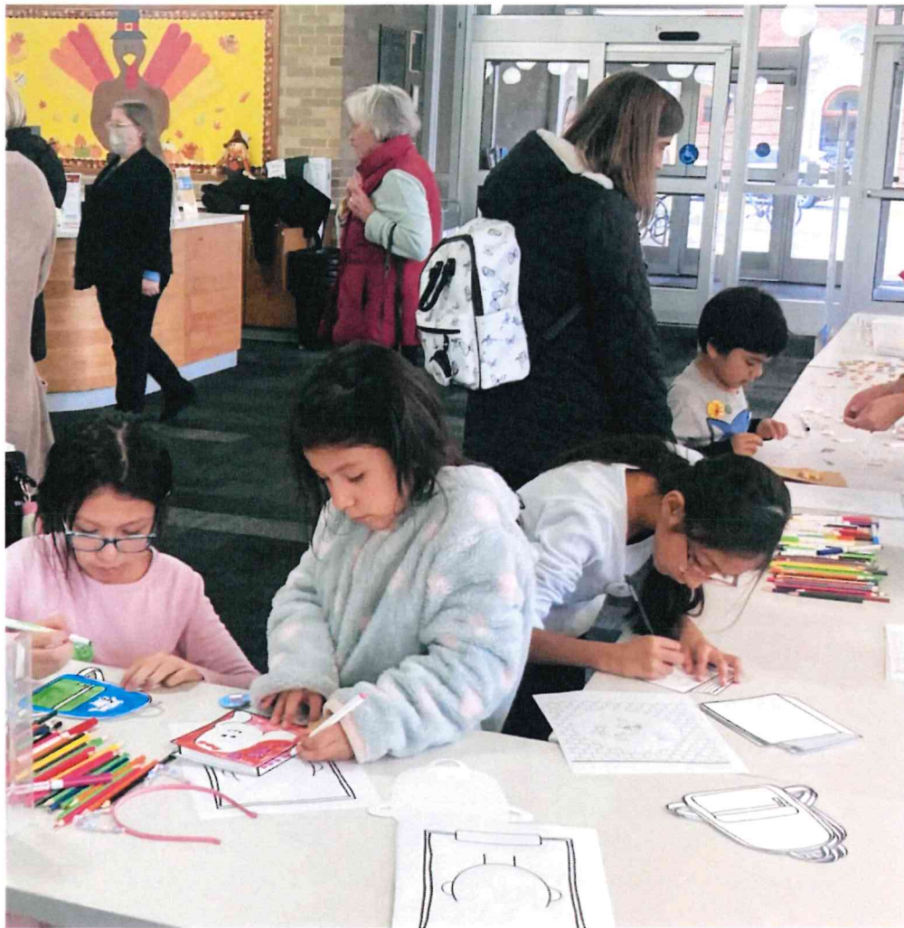
Children were invited to create their own art.