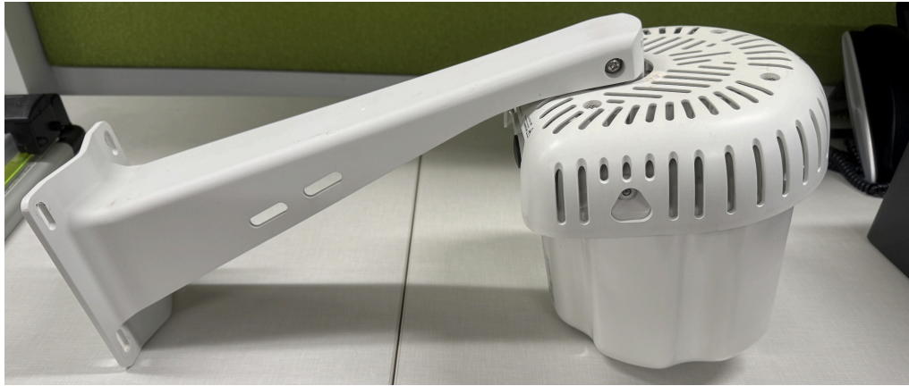
Outdoor Access Point back